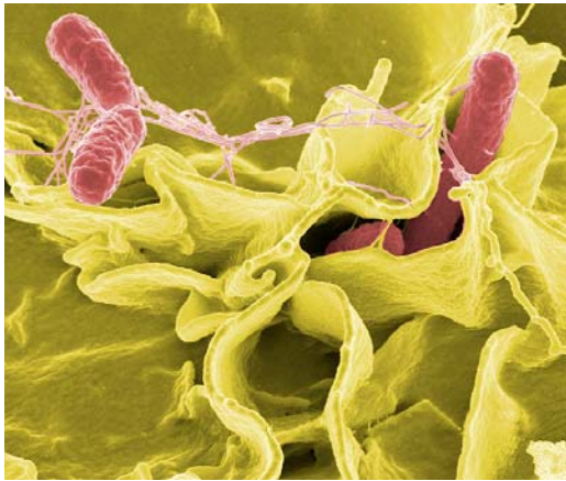
Photo 2. Picture of attached Salmonella with flagella.